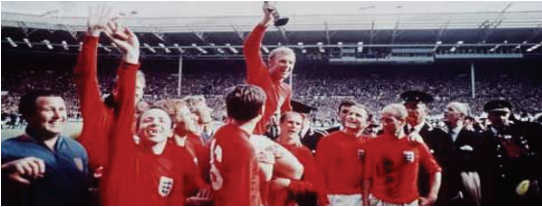
Bobby Moore lifts the World Cup for England in 1966 in front of 100,000 fans at Wembley.

Imagine these images without the extras – the crowds, the paparazzi, the man in the shirt standing in front of the tanks.