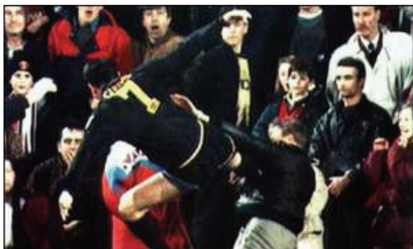
Eric Cantona jumps into the crowd.

Look at these images and think about who the stars might be.