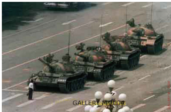
A lone man defies tanks in Tiananmen Square