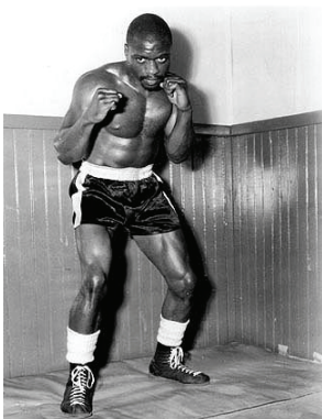
Rubin 'The Hurricane' Carter

In life she would have been seen as an extra; someone without whom the lawyers, doctors and artists would not exist. And yet her diary has allowed generations to glimpse and gain some understanding of the Holocaust.